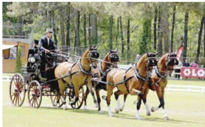
Photo: Team Weber in the dressage at the Saumur CAI. (Photo courtesy of PixelVisuel.com)

Follow Team Weber at www.chesterweber.com and via the link to Facebook.