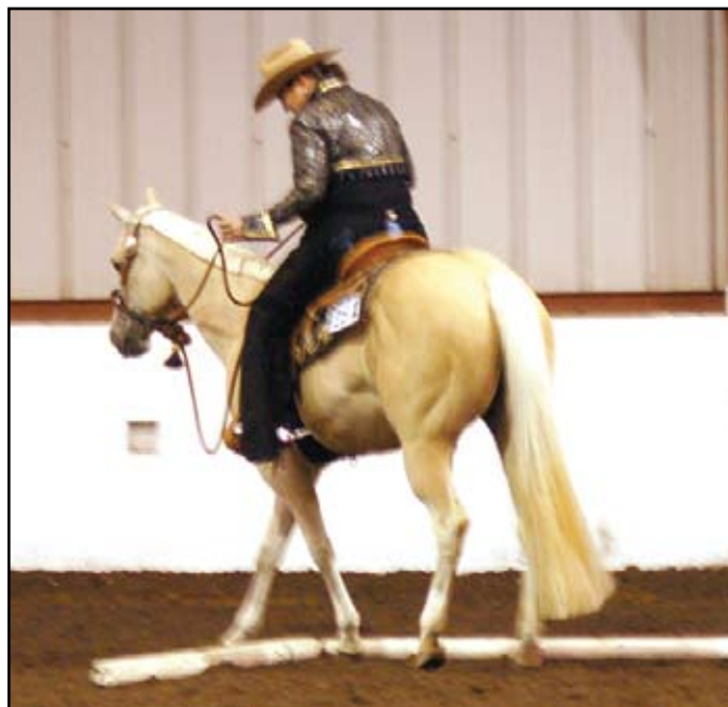
Photos above and right: Members of the North Dakota Quarter Horse Association (NDQHA) held its all Novice Show Sunday, June 9 at the West Fargo Fairgrounds offering 74 classes. the NDQHA Mission is to provide quality equine activities, programs, and services that enhance the recreational and economic use of the American Quarter Horse by each of our members.

The wind of heaven is that which blows between a horse's ears. ~ Arabian proverb