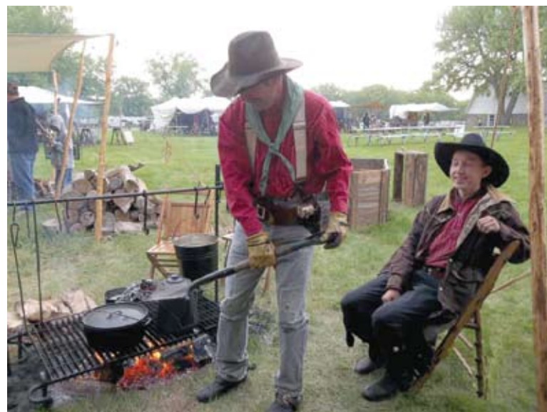
Above: 2013 Fort Sisseton, S.D., Festival -- page 2