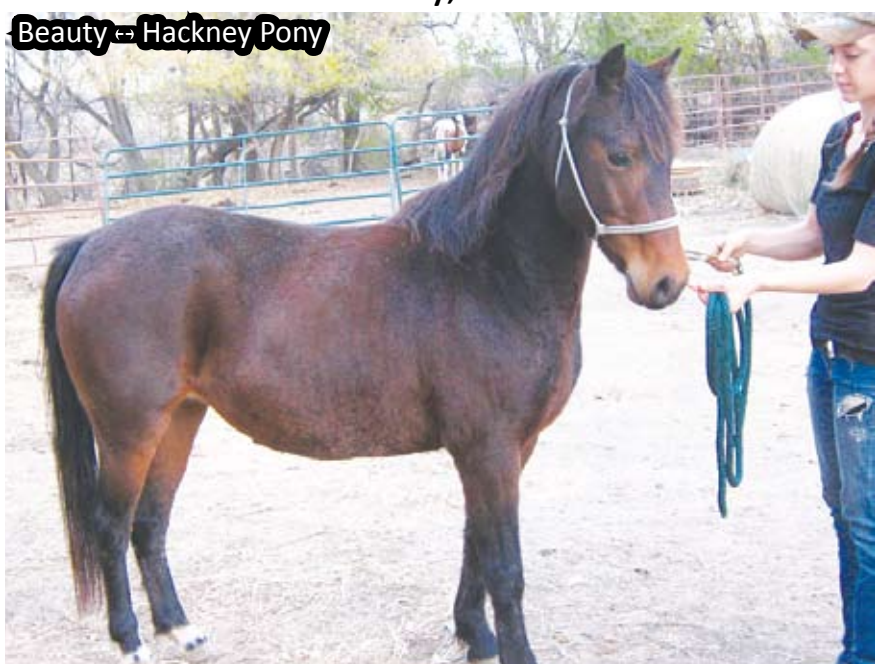
Beauty - Hackney Pony

High Tail Horse Ranch and Rescue chart@loretel.net ranch # 701-526-3734 Hawley, Minn.